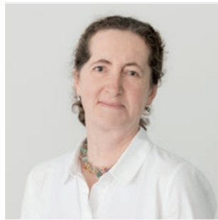
Romy Rössler Office

Consultation hours: Mo/Wedn/Thur 9 am – 3 pm, Tue 9 am – 4 pm, Fr 9 am – 1 pm